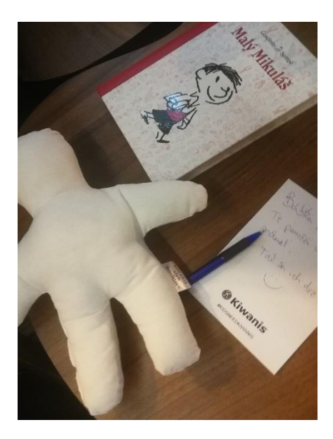
Figure 2 Photos of packing the books, Kiwanis dolls and written personal notes.

The social action during Kiwanis Meetup in Slovakia was packing children's books – that people brought – together with Kiwanis dolls and hand-written personal cards . A few days after the event, these packages were delivered to an agreed kids hospital department.