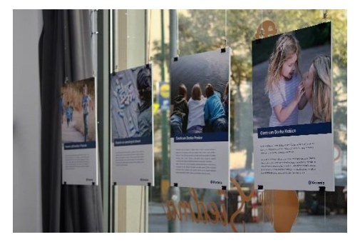
Figure 7 Portable boards hanging in the place of Kiwanis meetup

Only create this if you want to send invitation to someone that prefers the traditional way via email and/or does not have a Facebook account. Otherwise it is not necessary.